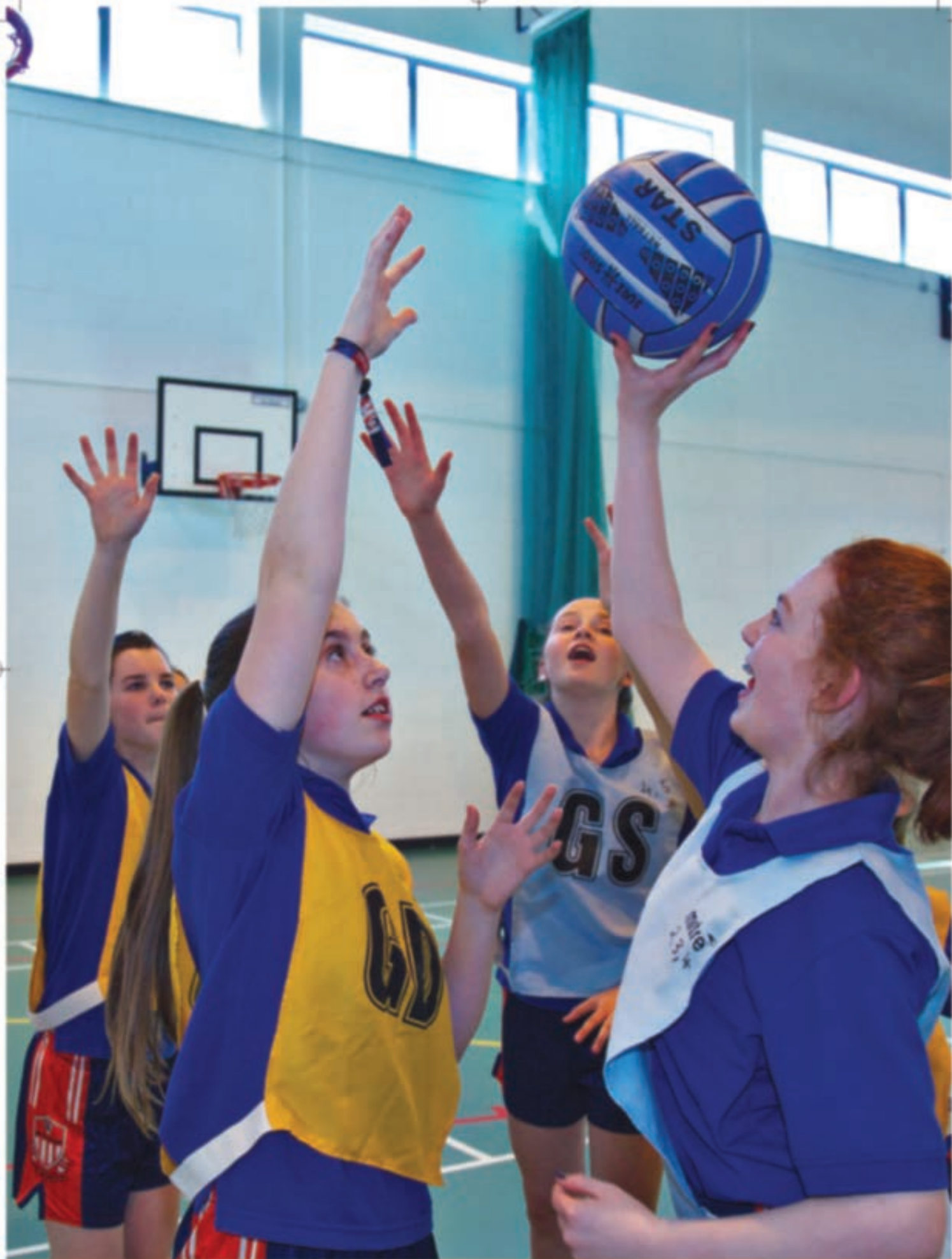
St. Mary's Secondary School