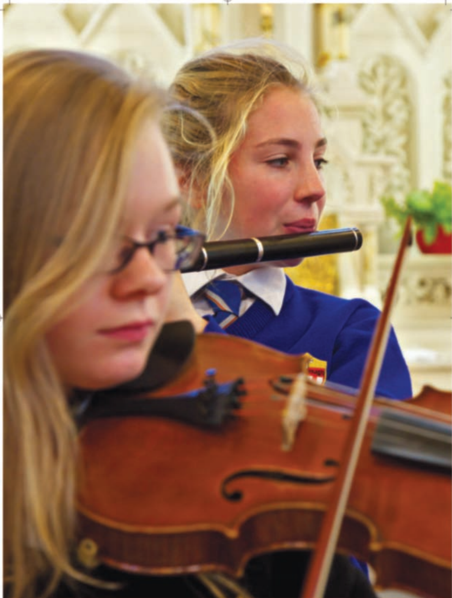
St. Mary's Secondary School