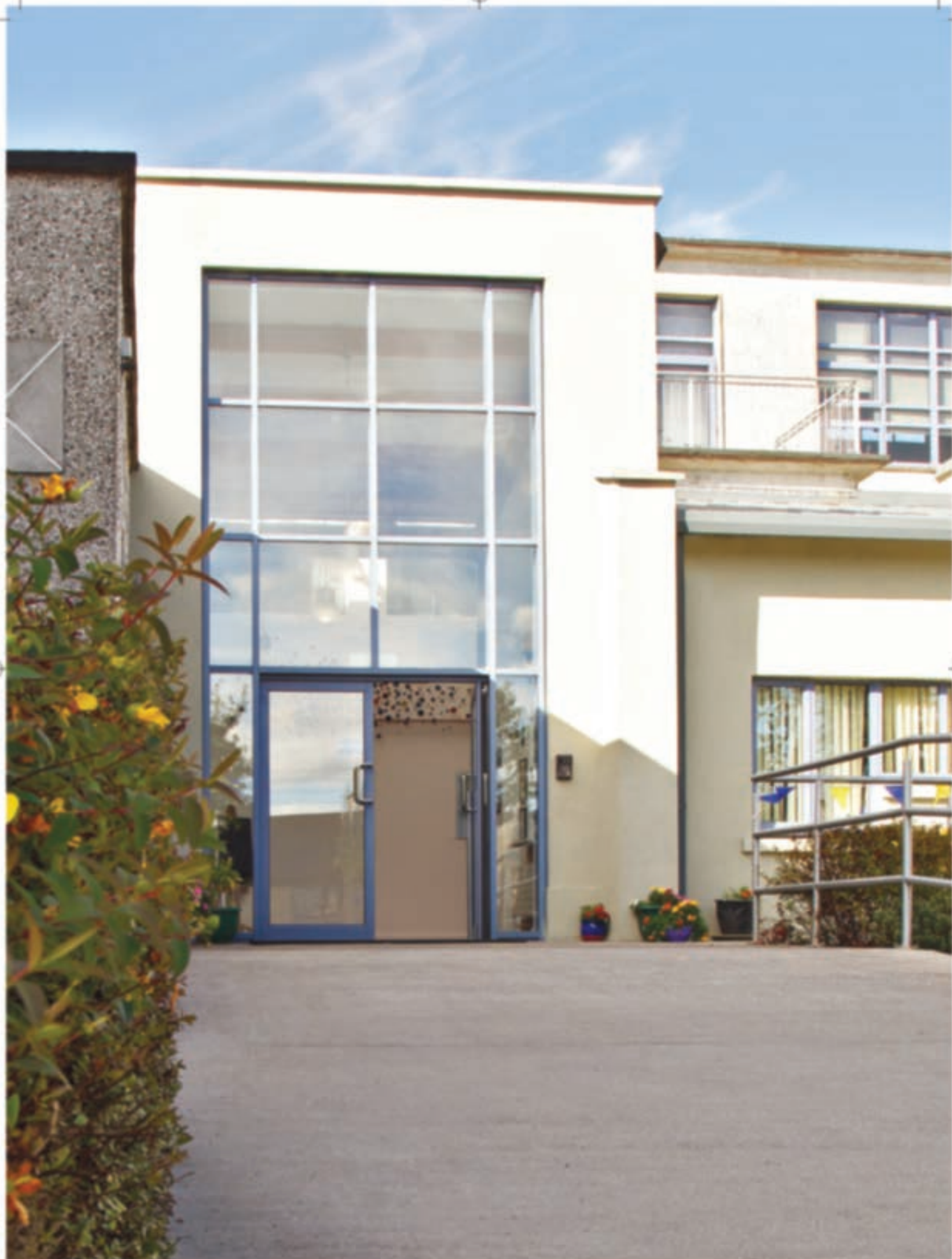
St. Mary's Secondary School